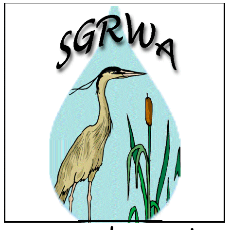
...every drop counts